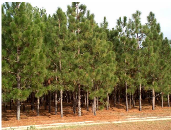
A longleaf pine plantation managed for pine straw production.