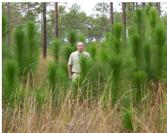
Longleaf pine trees in the sapling growth stage.

Containerized longleaf pine seedlings are available to purchase from the N.C. Division of Forest Resources state nursery, as well as from commercial nurseries. For more assistance in determining if longleaf pine is suitable to grow on your forestland, speak with a registered forester or contact your county forest ranger office. More information is also available on the website, www.dfr.nc.gov .